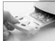
Removable slide out crumb tray